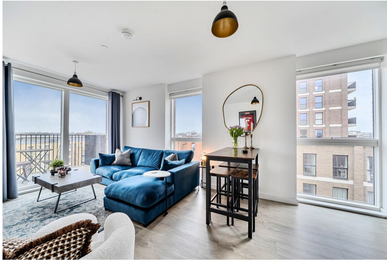
2 Carraway Street, Reading, RG1 3FY Price £300,000 Leasehold

Masons are proud to offer to the market this immaculately presented one bedroom apartment, located at the popular Bakers Yard development in Reading, while being a short walk of Reading town centre & mainline station, while offering great access to the M4 Motorway. The property has the added bonus of coming with a allocated parking space, while the accommodation offers a 22ft open plan kitchen/living/dining area with a sliding door to feature balcony with far reaching views. Further benefits include a 15ft bedroom, a bathroom and storage cupboard. NO ONWARD CHAIN. Viewing recommended.