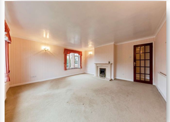
Tabornes Field Crow Lane, South Muskham Newark NG23 6DZ