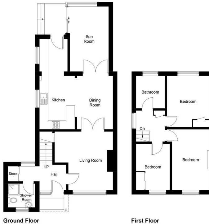
Illustration for identification purposes only, measurements are approximate, not to scale. (ID1311359)