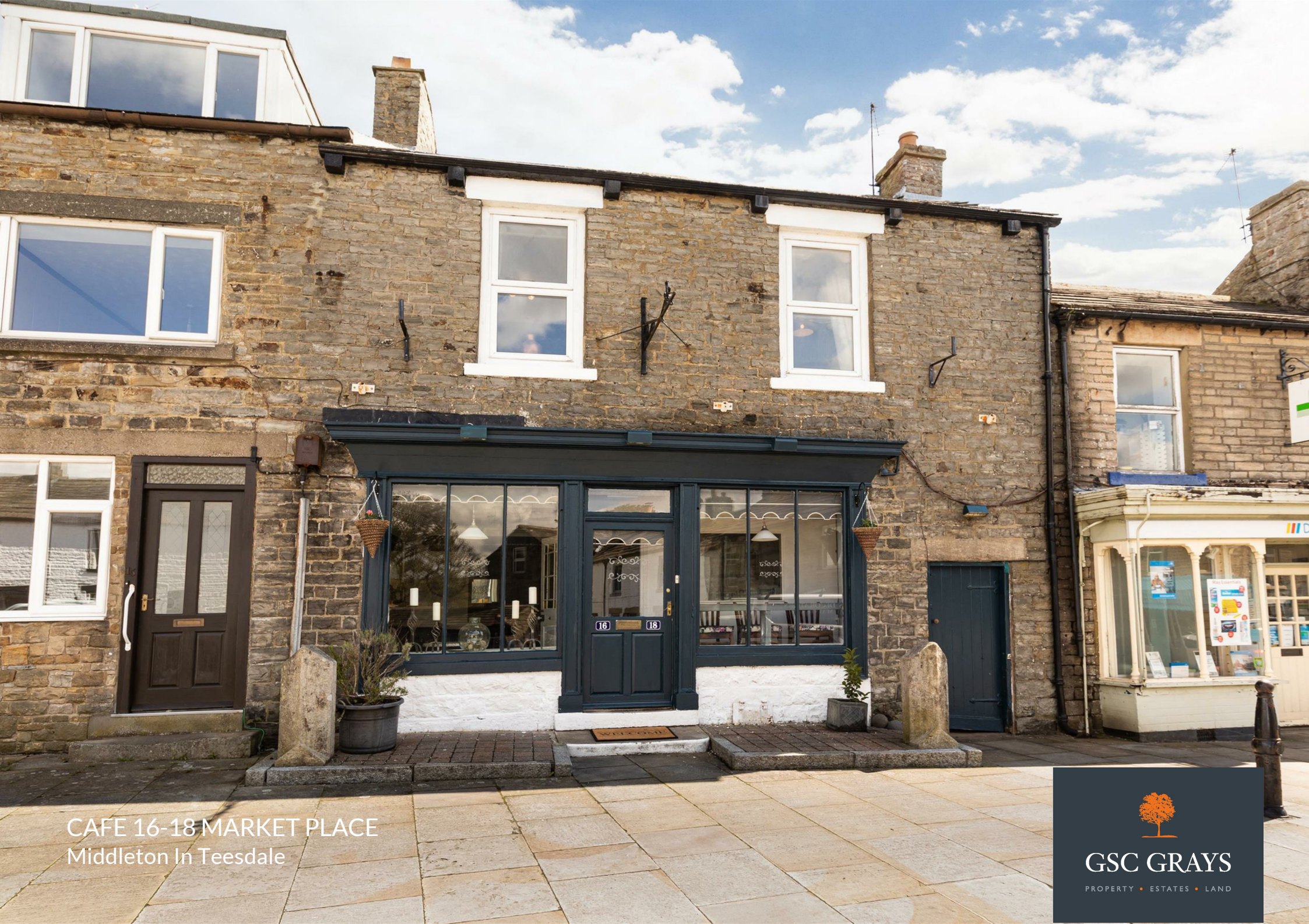
CAFE 16-18 MARKET PLACE Middleton In Teesdale