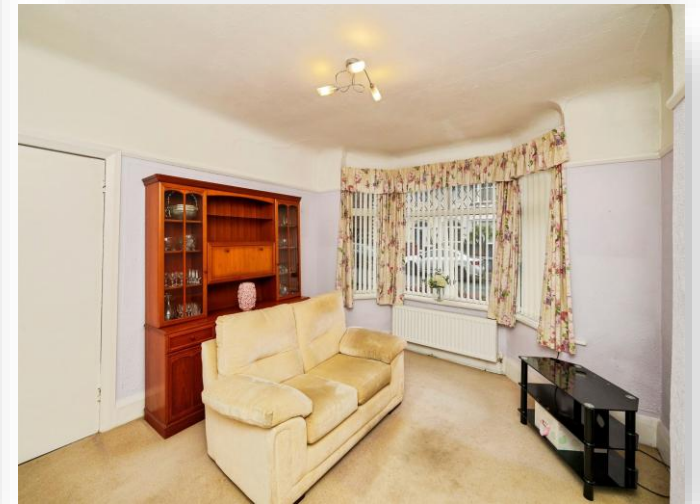
Cliff Road, WALLASEY, CH44 3AX