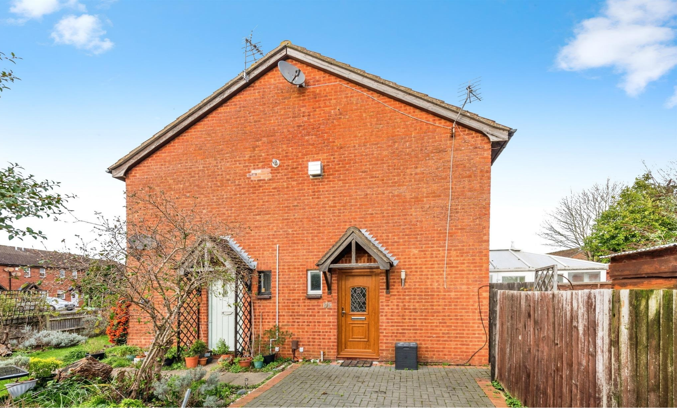
Norris Close, ABINGDON, OX14 2RW