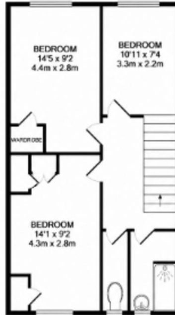
1ST FLOOR APPROX. FLOOR AREA 413 SQ.FT. (38.3 SQ.M.)

TOTAL APPROX. FLOOR AREA 884 SQ.FT. (82.0 SQ.M.)