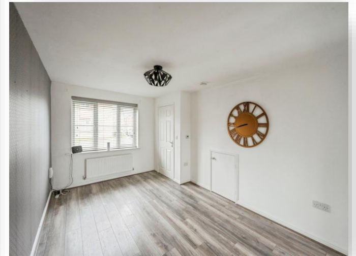
South Moor Drive, Goldthorpe Rotherham S63 9QA