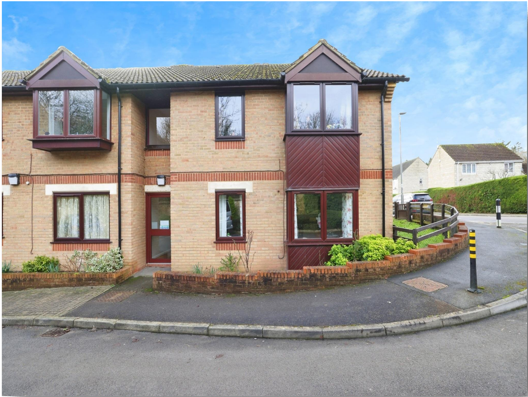
Ivyfield Court Charter Road, Chippenham SN15 2QR