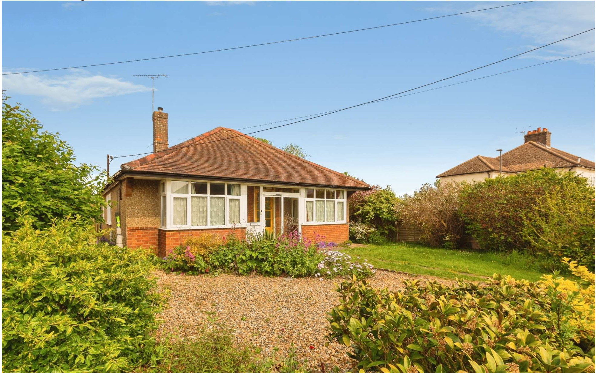
WESTON ROAD, ASTON CLINTON Buckinghamshire HP22 5EJ