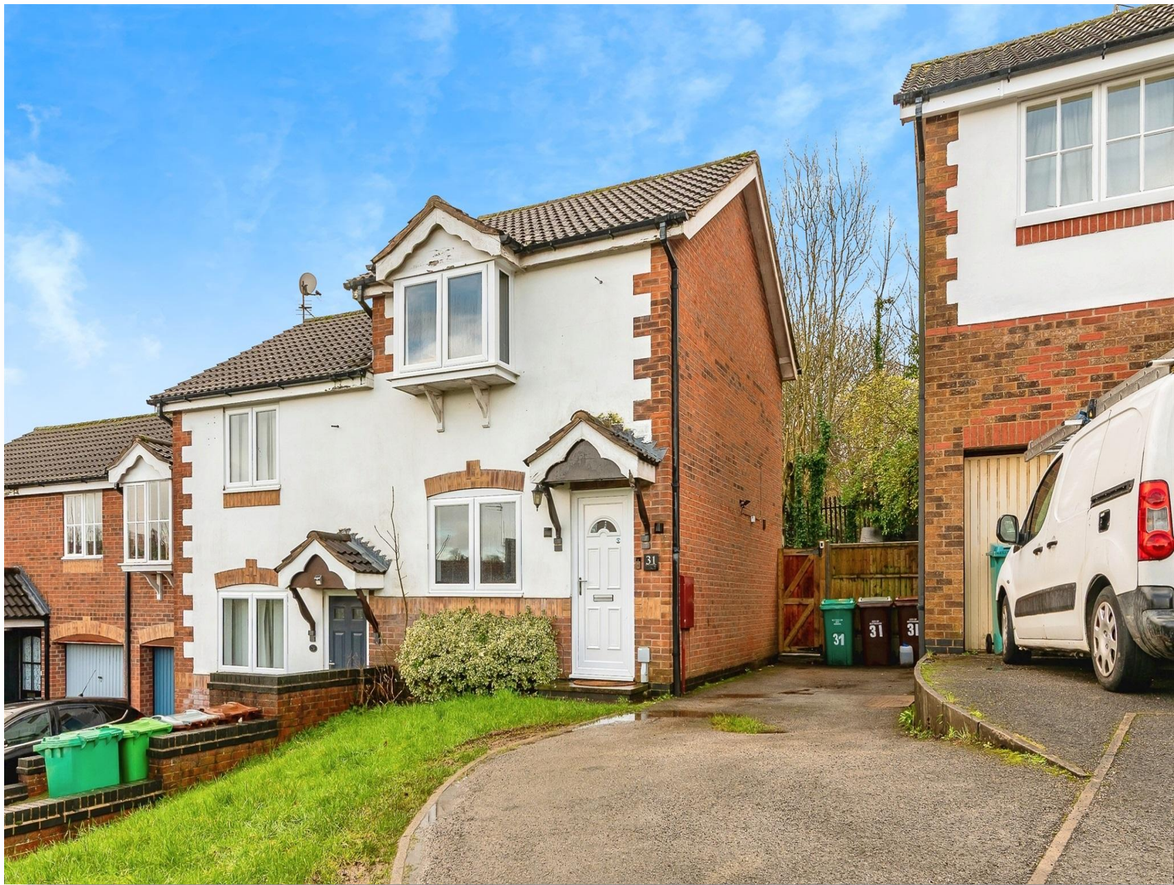
Hazelbank Avenue, Nottingham NG3 3EY