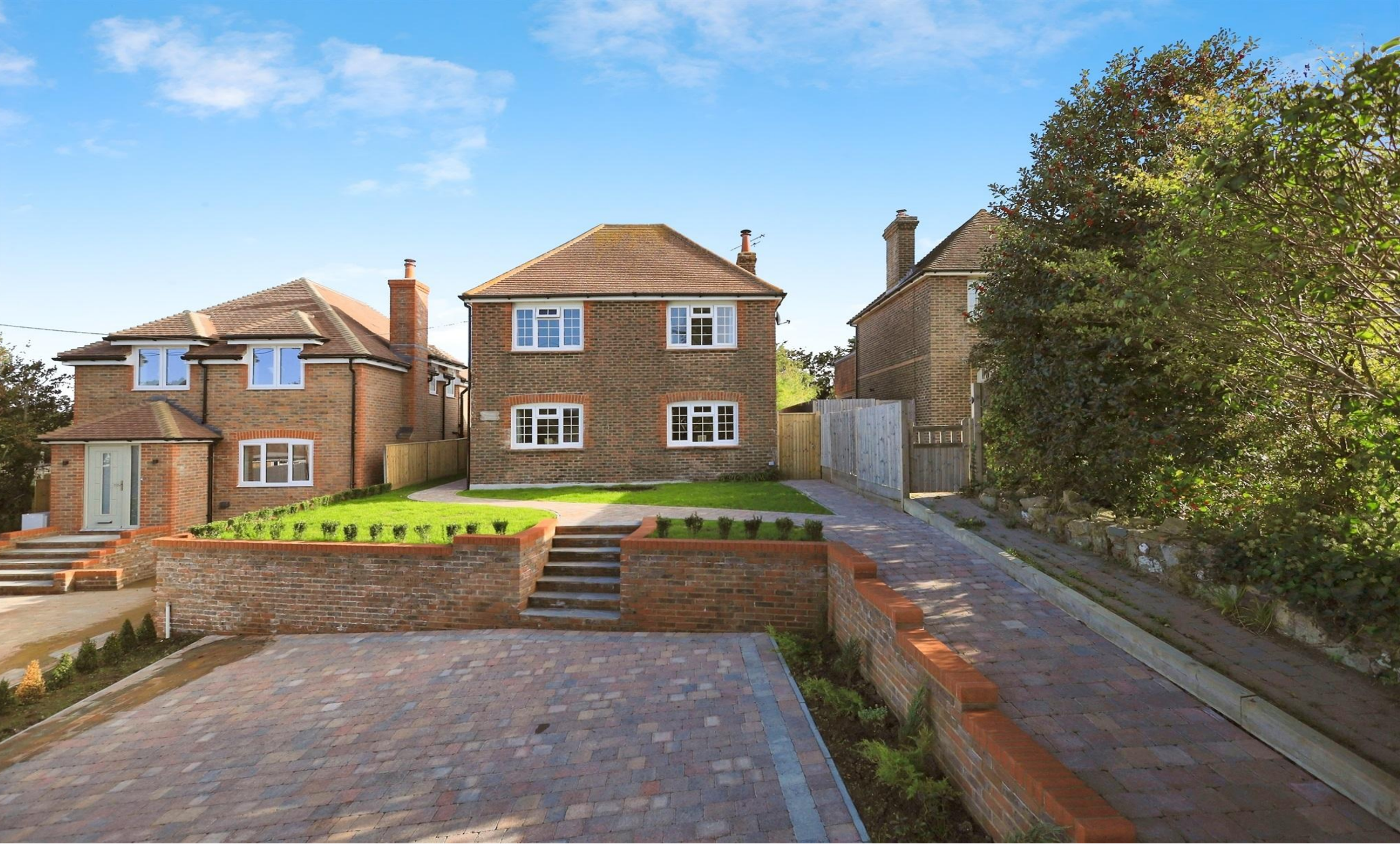
Wannock Cottage Wannock Road, Polegate BN26 5PE