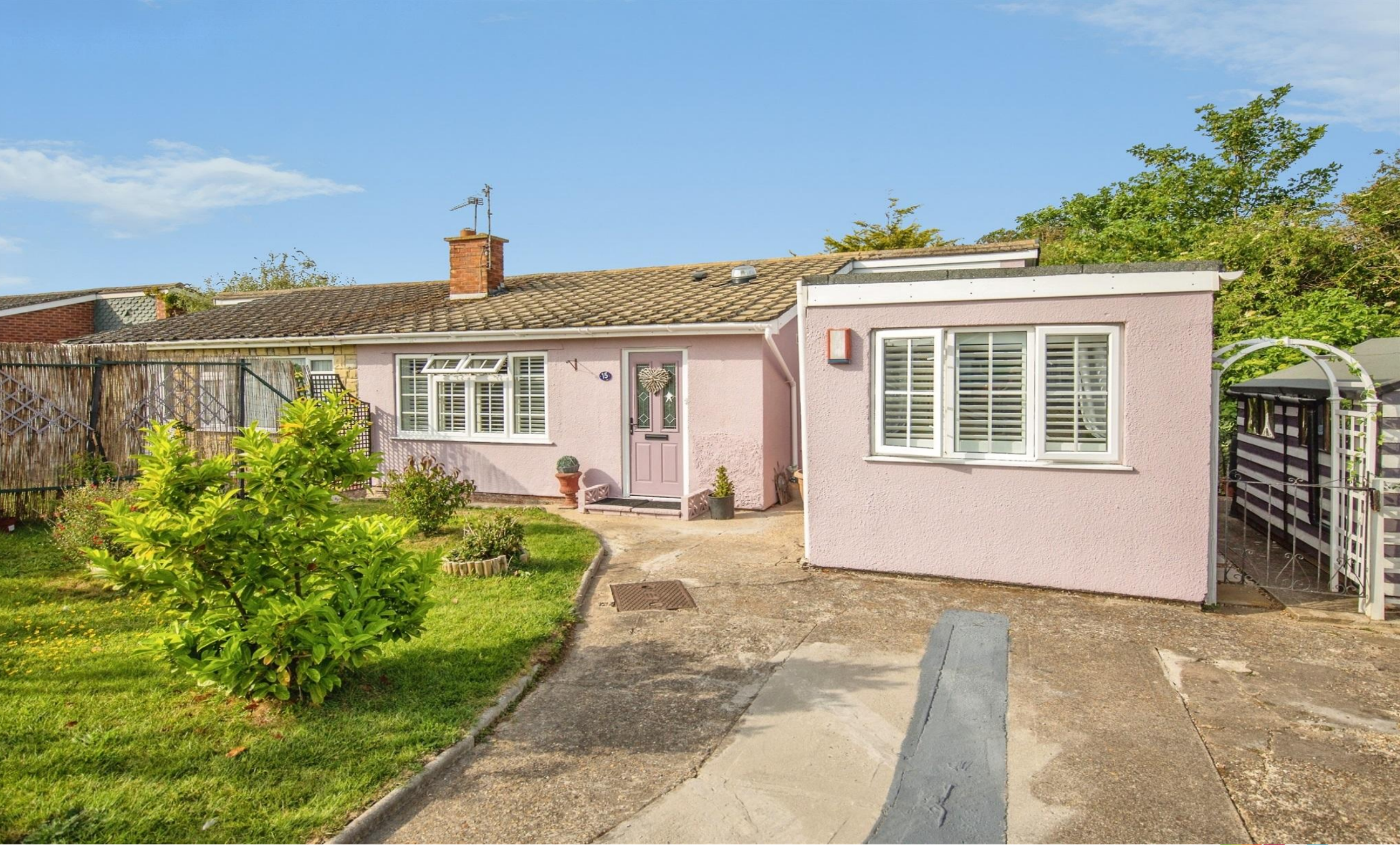
Sparrows Herne, CLACTON-ON-SEA CO15 4HN