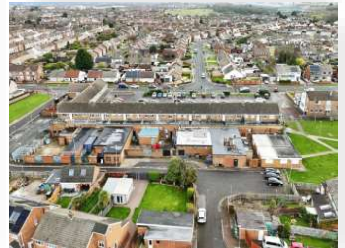
Catcote Road, Hartlepool TS25 2LS