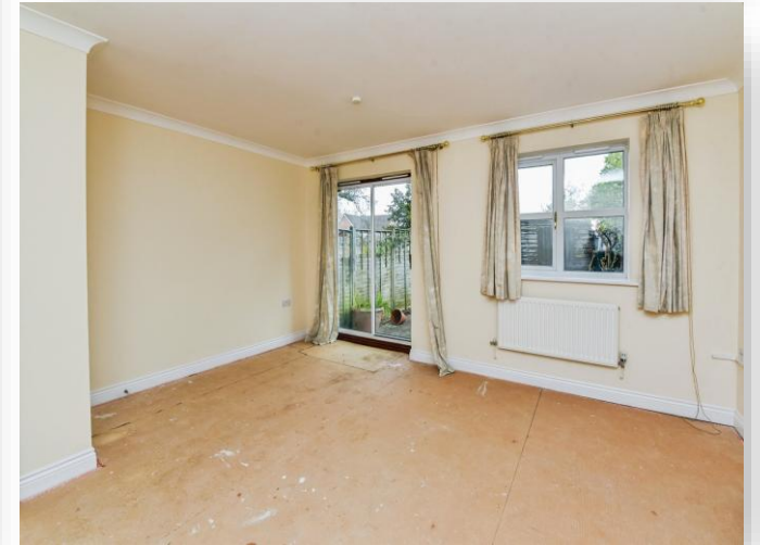
Shire Way, Westbury BA13 3GF