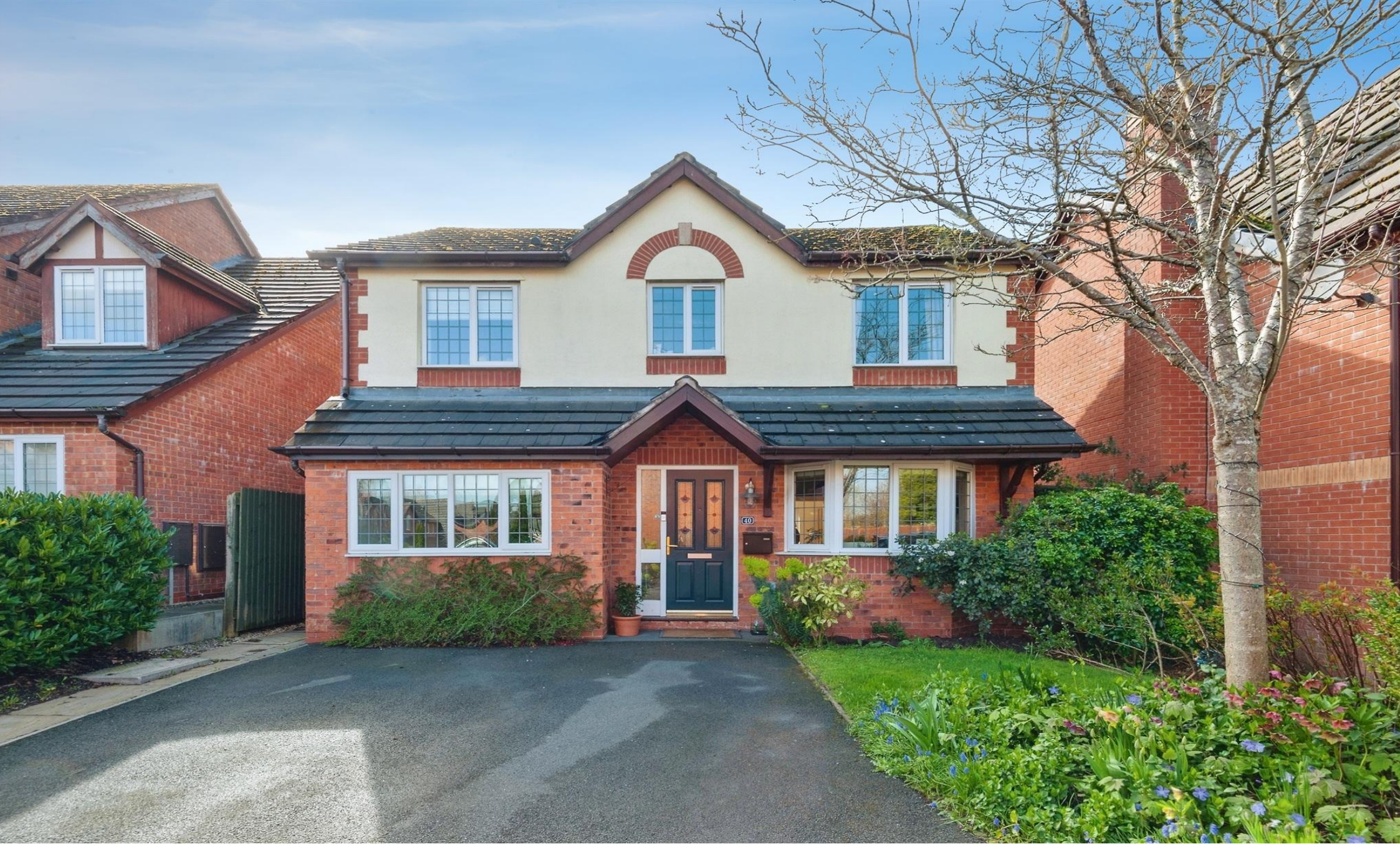
Bridgewater Grange, Preston Brook Runcorn WA7 3AL