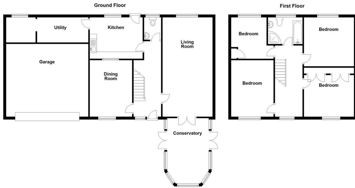
Artists impression, for illustration purposes only. All measurements are approximate. Not to Scale. Plan produced using PlanUp.

Property to sell? We would be delighted to provide you with a free no obligation market assessment of your existing property. Please contact your local Halls office to make an appointment. Mortgage/financial advice. We are able to recommend a completely independent financial advisor,