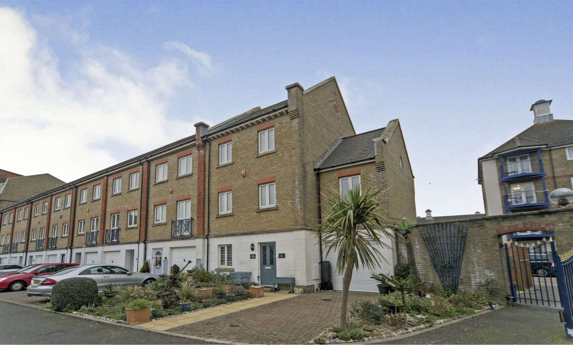
The Piazza, Eastbourne BN23 5TG