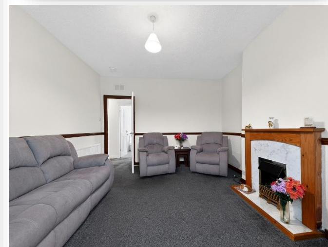
Glencairn Drive, Rutherglen Glasgow G73 1RG