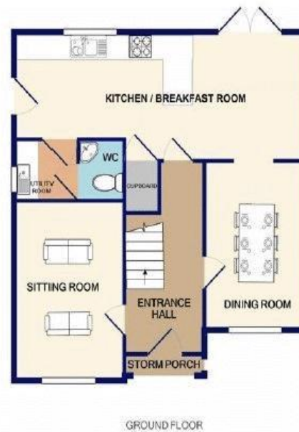
Four Bedroom Detached House Floor Plan (Plots 6 & 9) (not to scale for identification purposes only)

We've been working with people to fulfil their property ambitions since 1862. Our heritage is at the heart of the business but we are always looking for ways to innovate so we can provide a service that works for you.