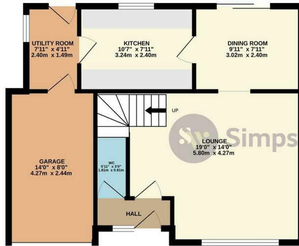
GROUND FLOOR 569 sq.ft. (52.9 sq.m.) approx.