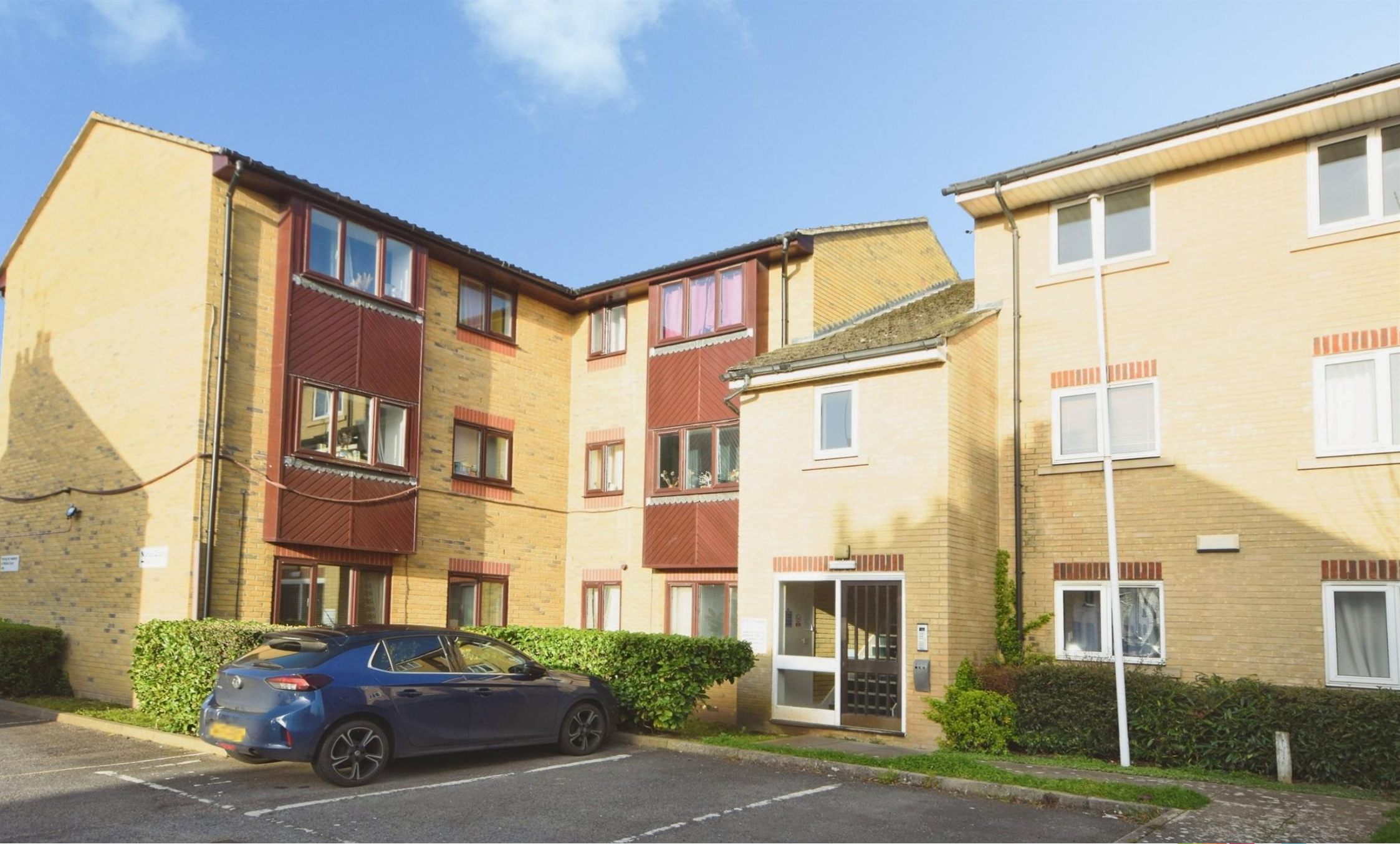
Nichols Court, Belle Vue, CHELMSFORD CM2 0BS