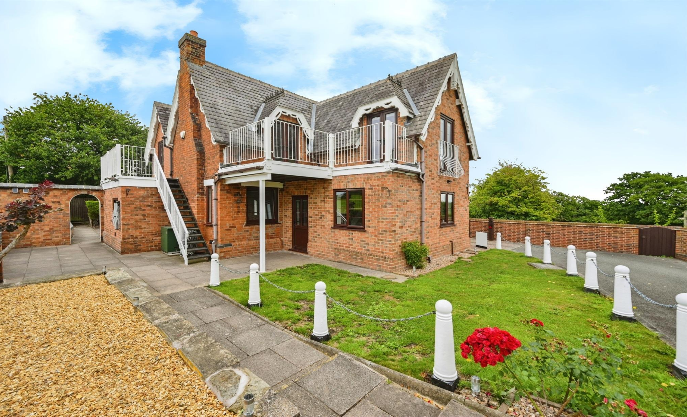
High View Cottage, Tatenhill Common, Rangemore, BURTON-ON-TRENT