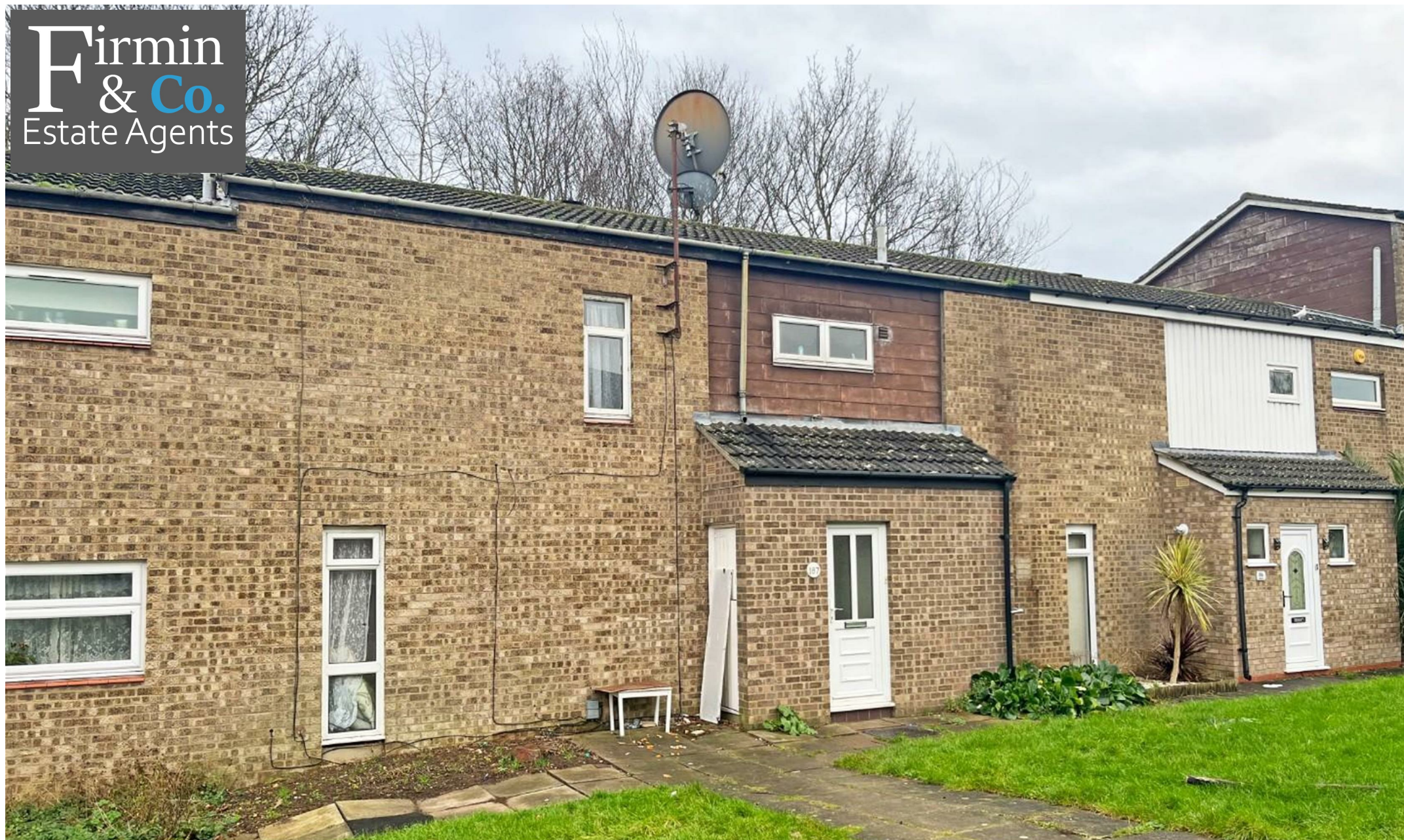
187 Kirkmeadow North Bretton PE3 8JN