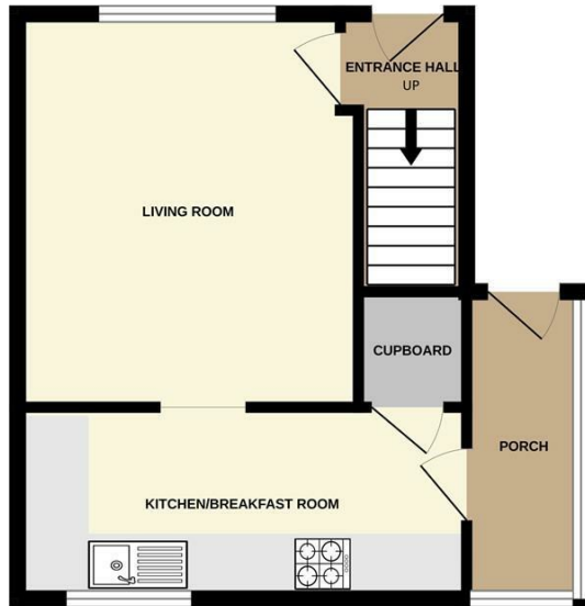
GROUND FLOOR 361 sq.ft. (33.5 sq.m.) approx.