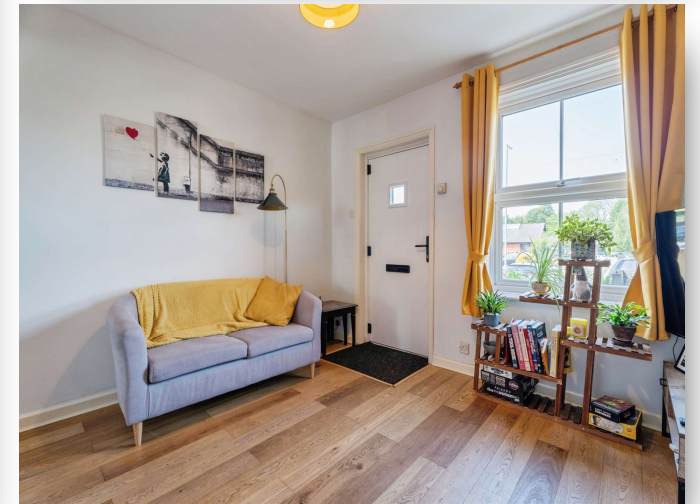
Combs Lane, STOWMARKET, IP14 2DA