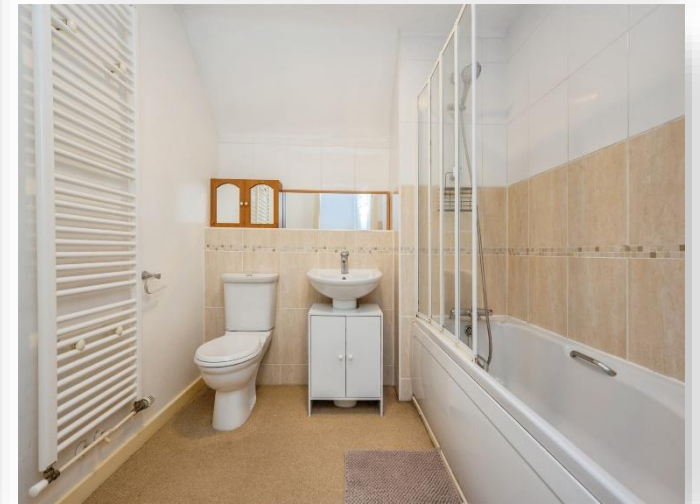
Roebuck Close, Uttoxeter. ST14 8AJ