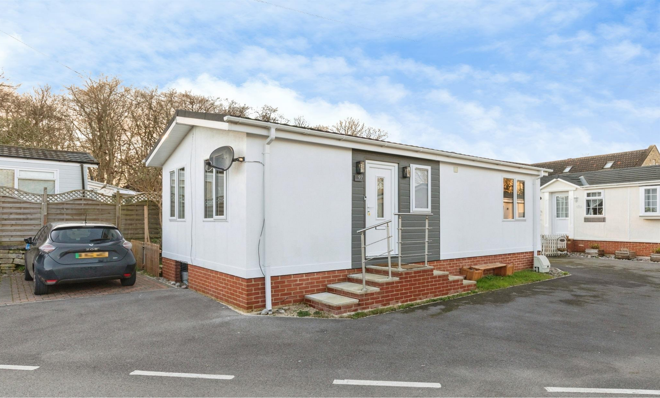
Quarry Rock Gardens, Bath BA2 6EG