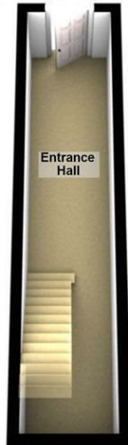
Ground Floor Approx. 13.1 sq. metres (141.3 sq. feet)