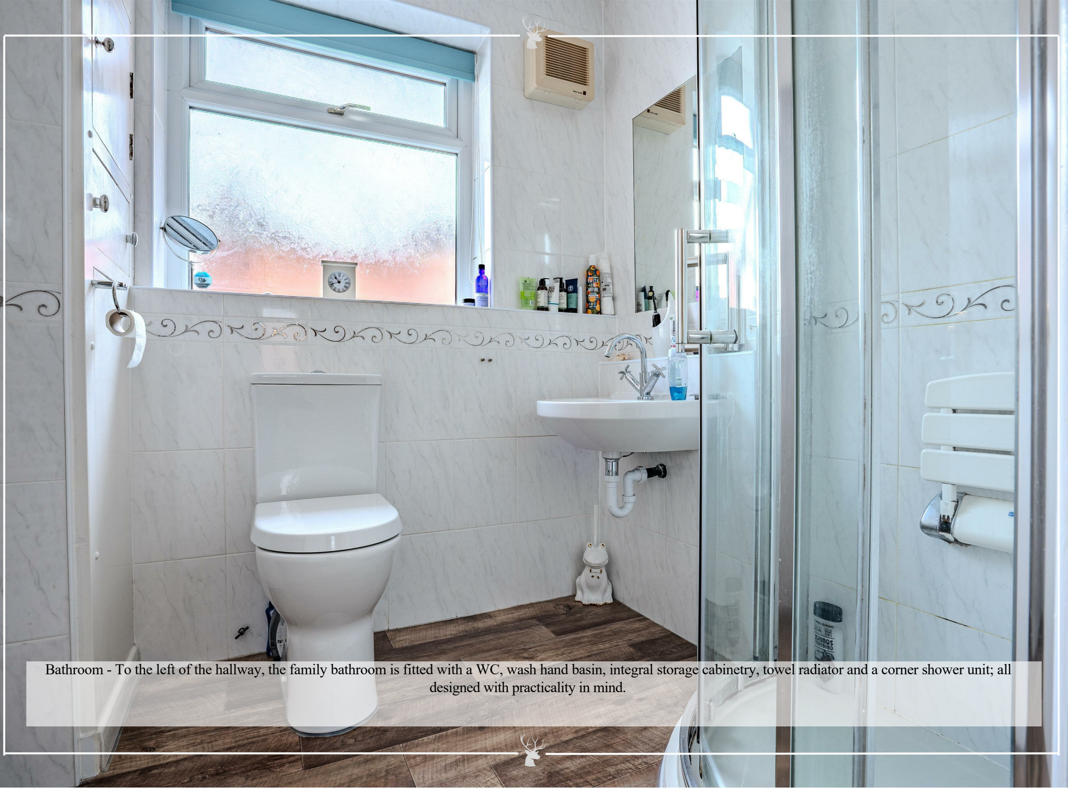
Bathroom - To the left of the hallway, the family bathroom is fitted with a WC, wash hand basin, integral storage cabinetry, towel radiator and a corner shower unit; all designed with practicality in mind.