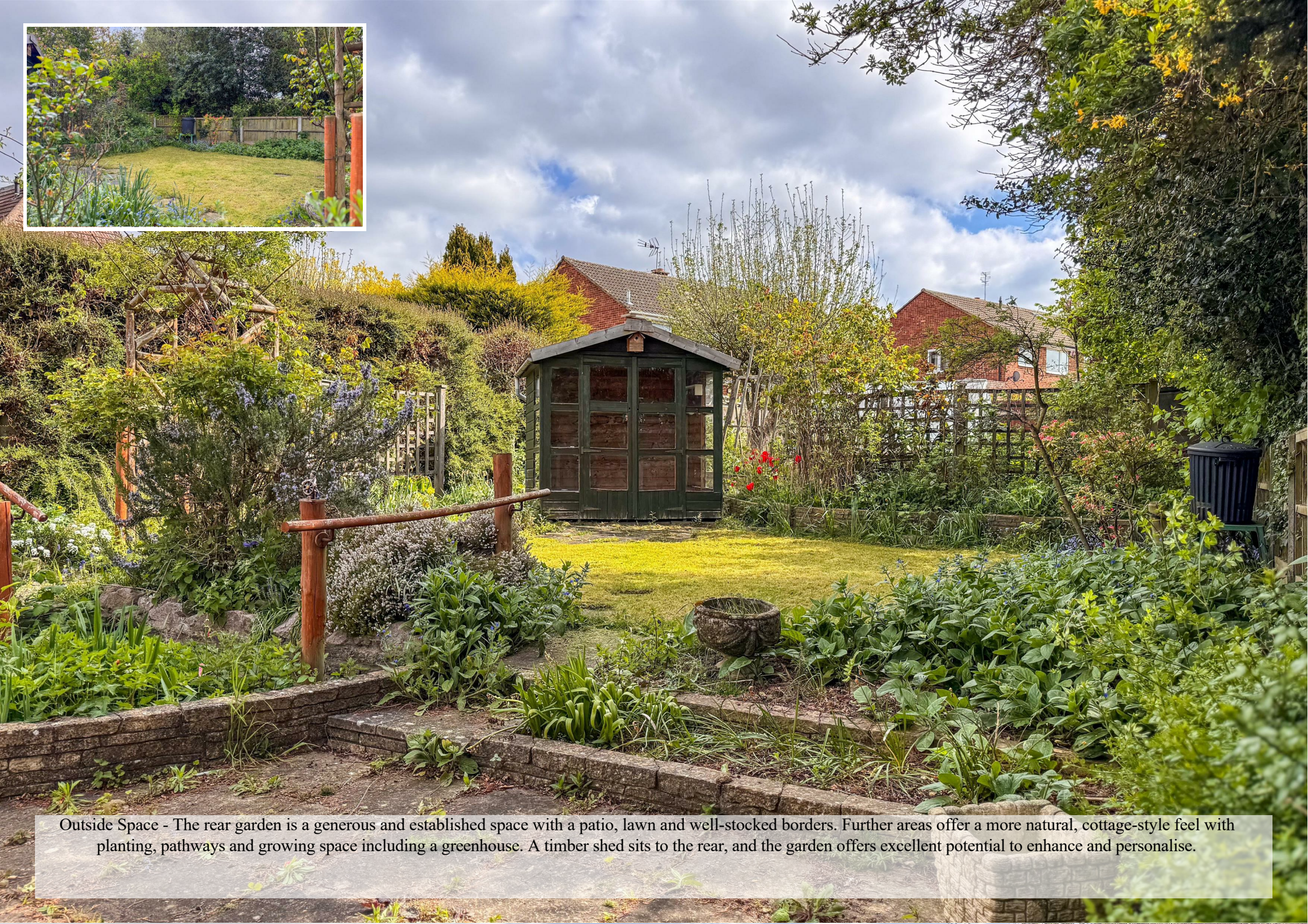
Outside Space - The rear garden is a generous and established space with a patio, lawn and well-stocked borders. Further areas offer a more natural, cottage-style feel with planting, pathways and growing space including a greenhouse. A timber shed sits to the rear, and the garden offers excellent potential to enhance and personalise.