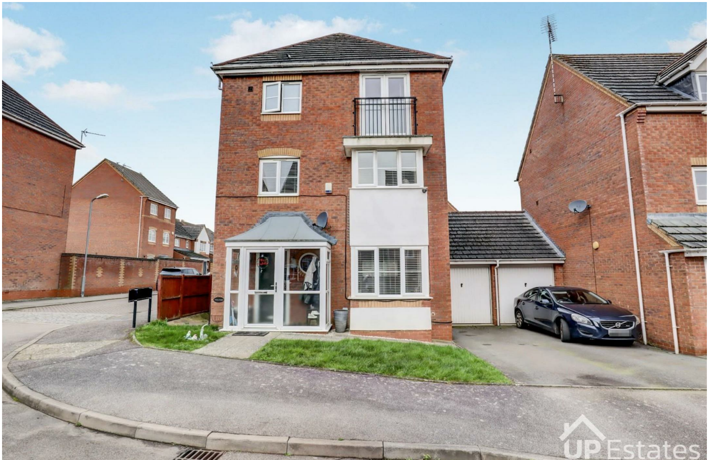
Passionflower Close, Bedworth