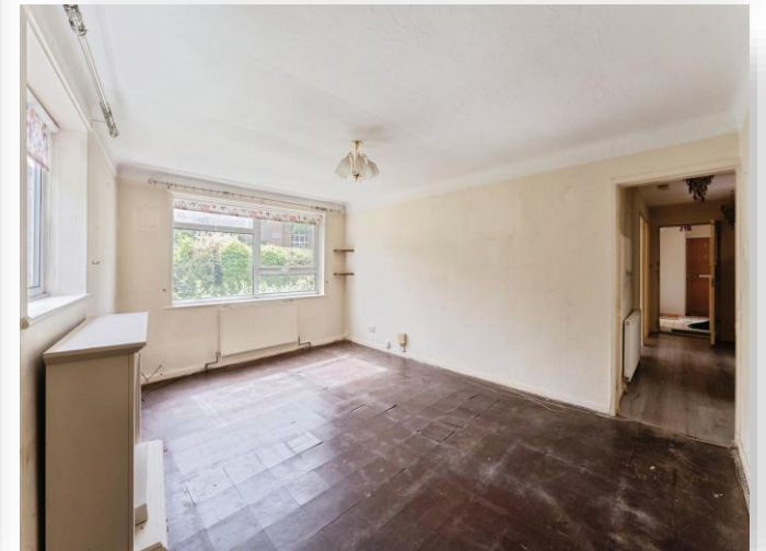
St. Stephens Court, Prenton Lane, Birkenhead, CH42 8QD