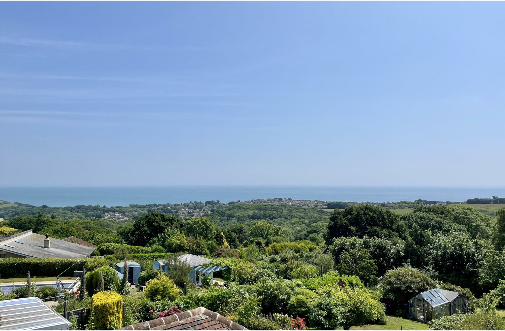
Linton Cottage, 75 Battery Hill, Fairlight, TN35 4AL