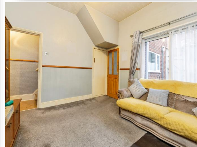
Alston Street, Hartlepool, TS26 9AQ