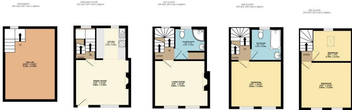
TOTAL FLOOR AREA : 1081 sq.ft. (100.4 sq.m.) approx. Measurements are approximate. Not to scale. Illustrative purposes only Made with Metropix ©2023