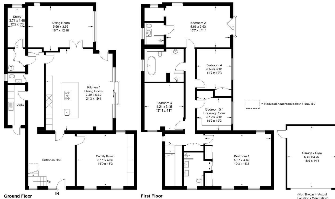
Illustration for identification purposes only, measurements are approximate, not to scale. floorplansUsketch.com © (ID801720)