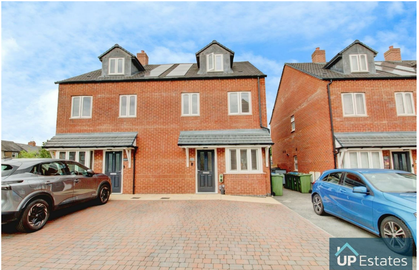
Shortwood Place, Coventry