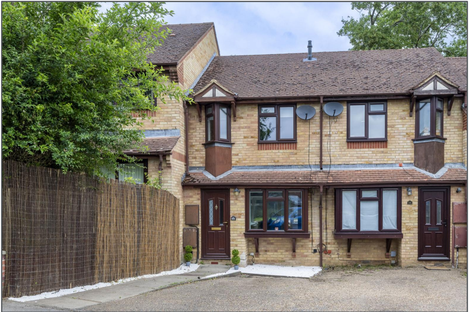
Linnet Green, Uckfield, TN22 5YD