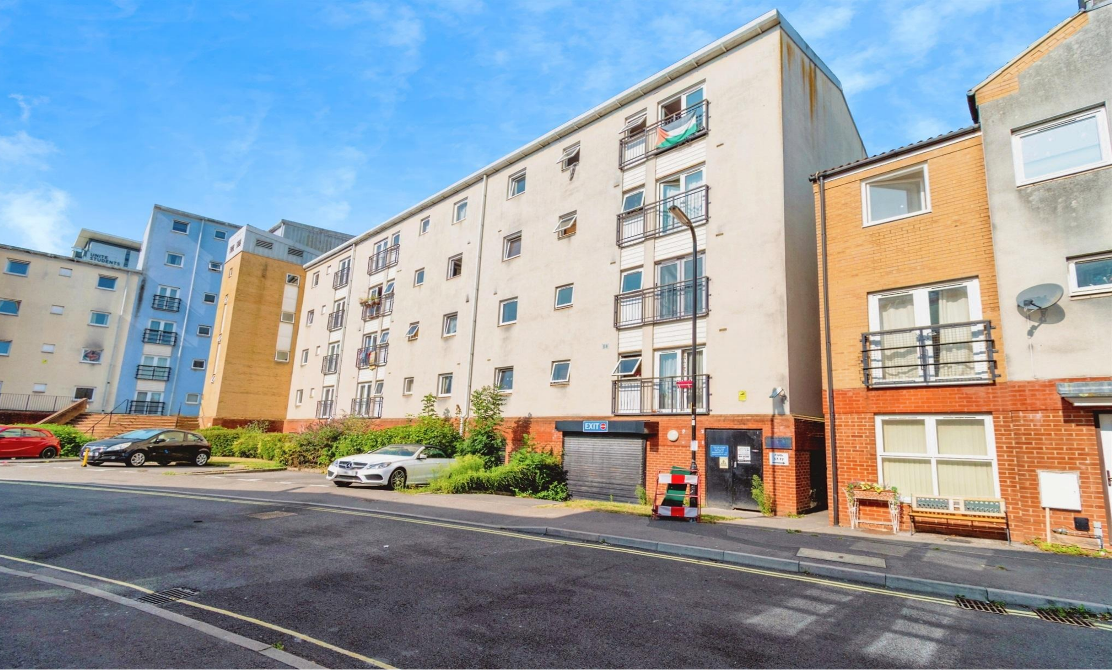
White Star Place, Southampton SO14 3GN