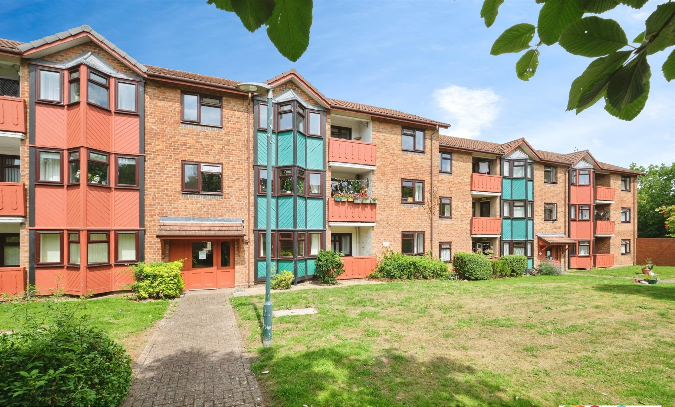
Crofton Gardens, Birmingham B36 8NP