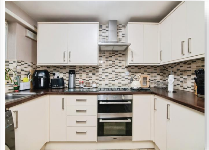
Foredraft Close, BIRMINGHAM B32 3TP