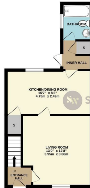
GROUND FLOOR 395 sq.ft. (36.7 sq.m.) approx.