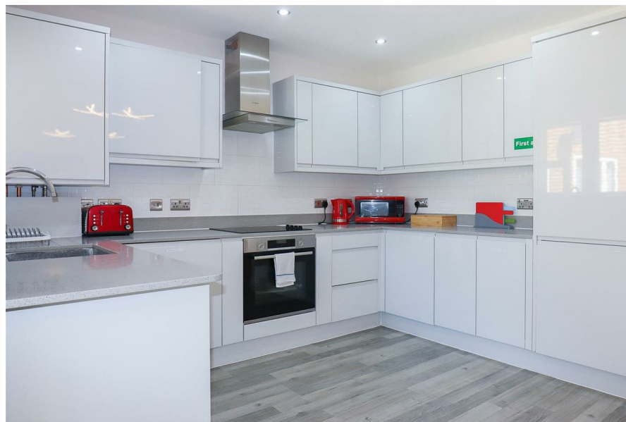
Flat 1 Tipps Cross Apartments Tipps Cross Lane, Hook End, Brentwood, CM15 0HR

TOTAL APPROX. FLOOR AREA 841 SQ.FT. (78.1 SQ.M.) THIS PLAN IS FOR ROOM IDENTIFICATION ONLY, AND ITS ACCURACY IS NOT GUARANTEED. www.epcsinessex.co.uk Made with Metropix ©2018