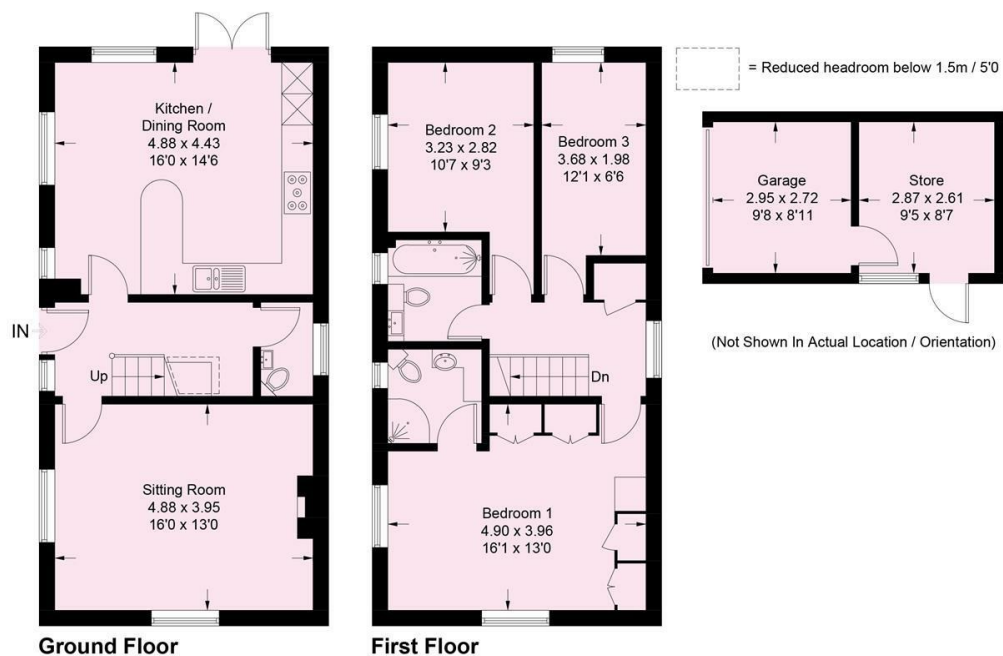
illustration for identification purposes only. measurements are approximate, not to scale Pursuant to RICS Property Measurement 2nd Edition © Intelligent Property Marketing 2026