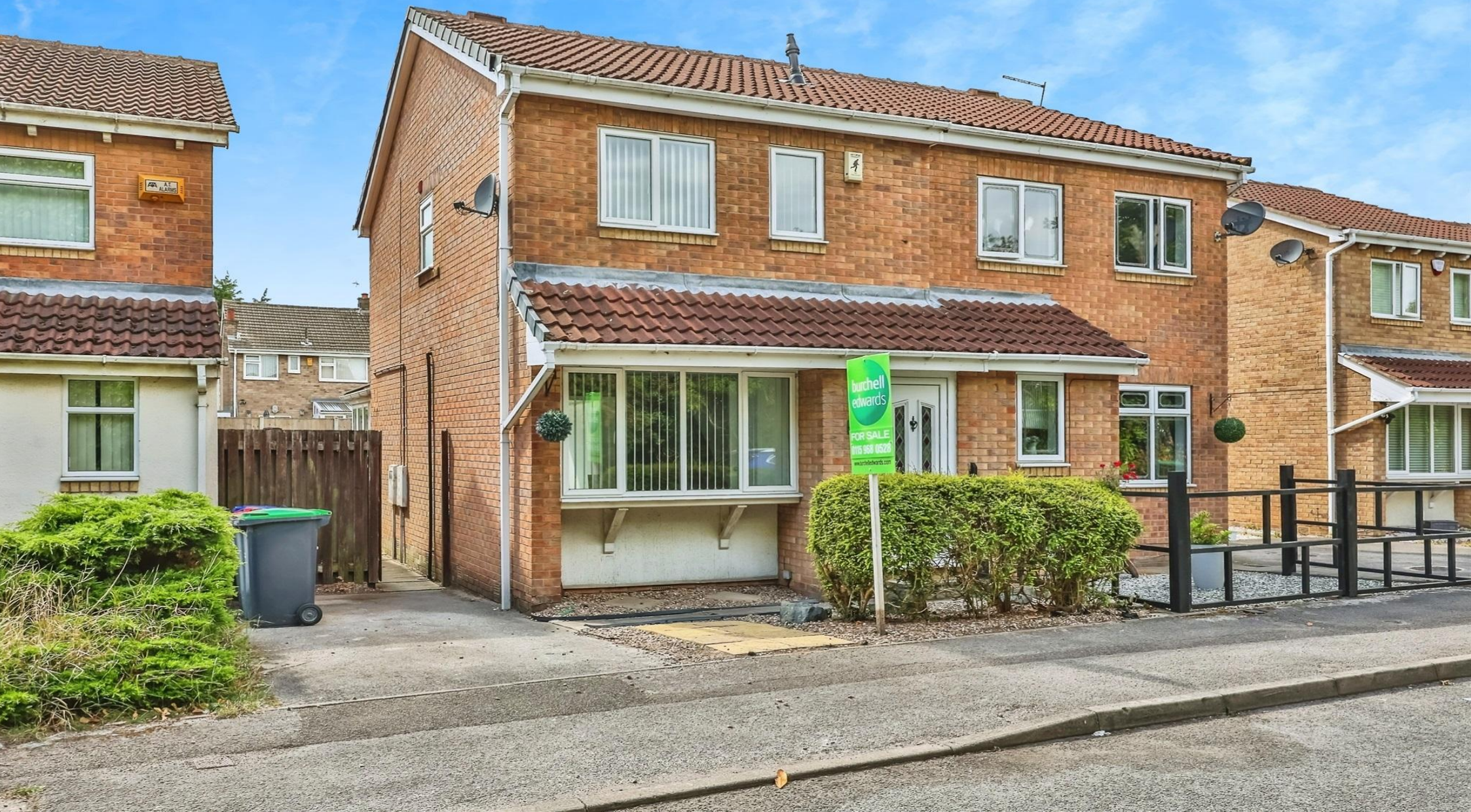
Hazel Meadows Hucknall Nottingham