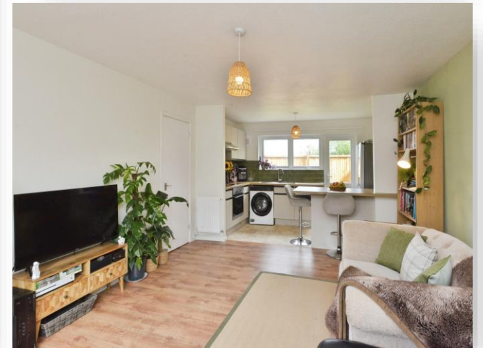
Rossal Place, Hodge Lea Milton Keynes MK12 6JE