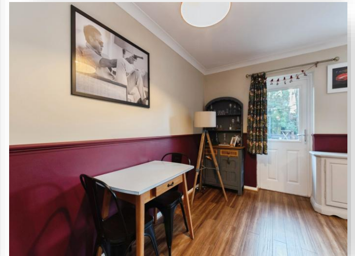
Lime Tree Close, Alderholt, Fordingbridge SP6 3RQ