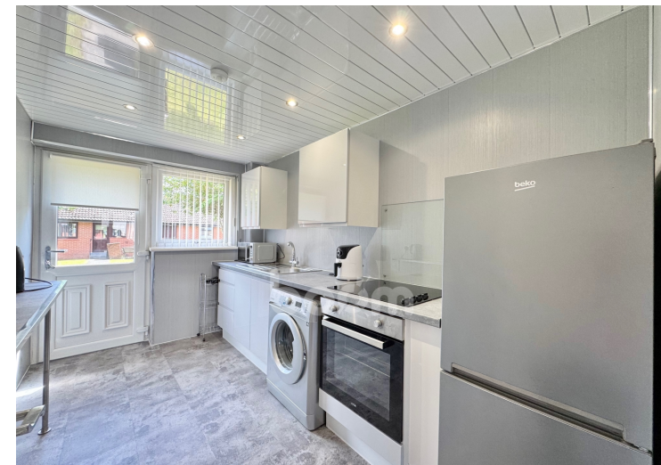
Bullwood Court, Glasgow