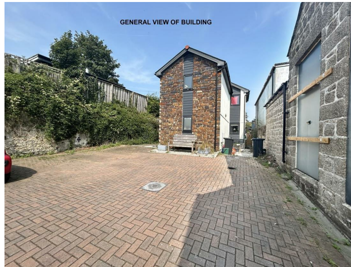
GENERAL VIEW OF BUILDING