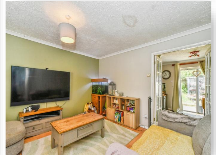
Water Mint Way, Calne SN11 0RT